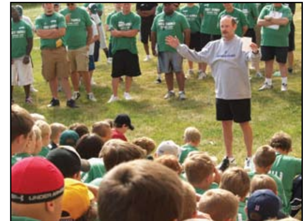
Former MN Vikings Head Coach Brad Childress speaks to 2006 campers about the importance of teamwork.