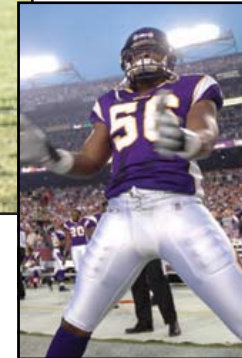
▶ Vikings Middle Linebacker EJ Henderson appeared at camp in 2008.